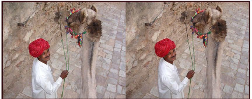
Camel Driver by Robert Bloomberg, USA entered in our 12th PSA stereo exhibition.

winning and accepted images are shown on our website: 3dpdx.org - please take time to view all the marvelous images. Ω