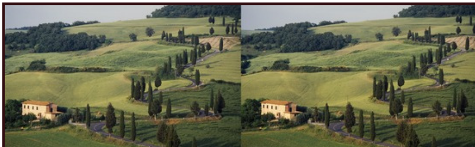
"Portrait of Tuscany" © 2010 Robert Bloomberg Thu Oct. 28, 2010 - Sun Dec. 26, 2010,

Art Exhibition: Thursday Oct. 7, 2010 - Sunday Nov. 28, 2010